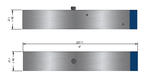
By request, BestCode can adapt hardware and software to meet specific application demands.