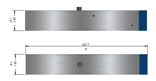
By request, BestCode can adapt hardware and software to meet specific application demands.